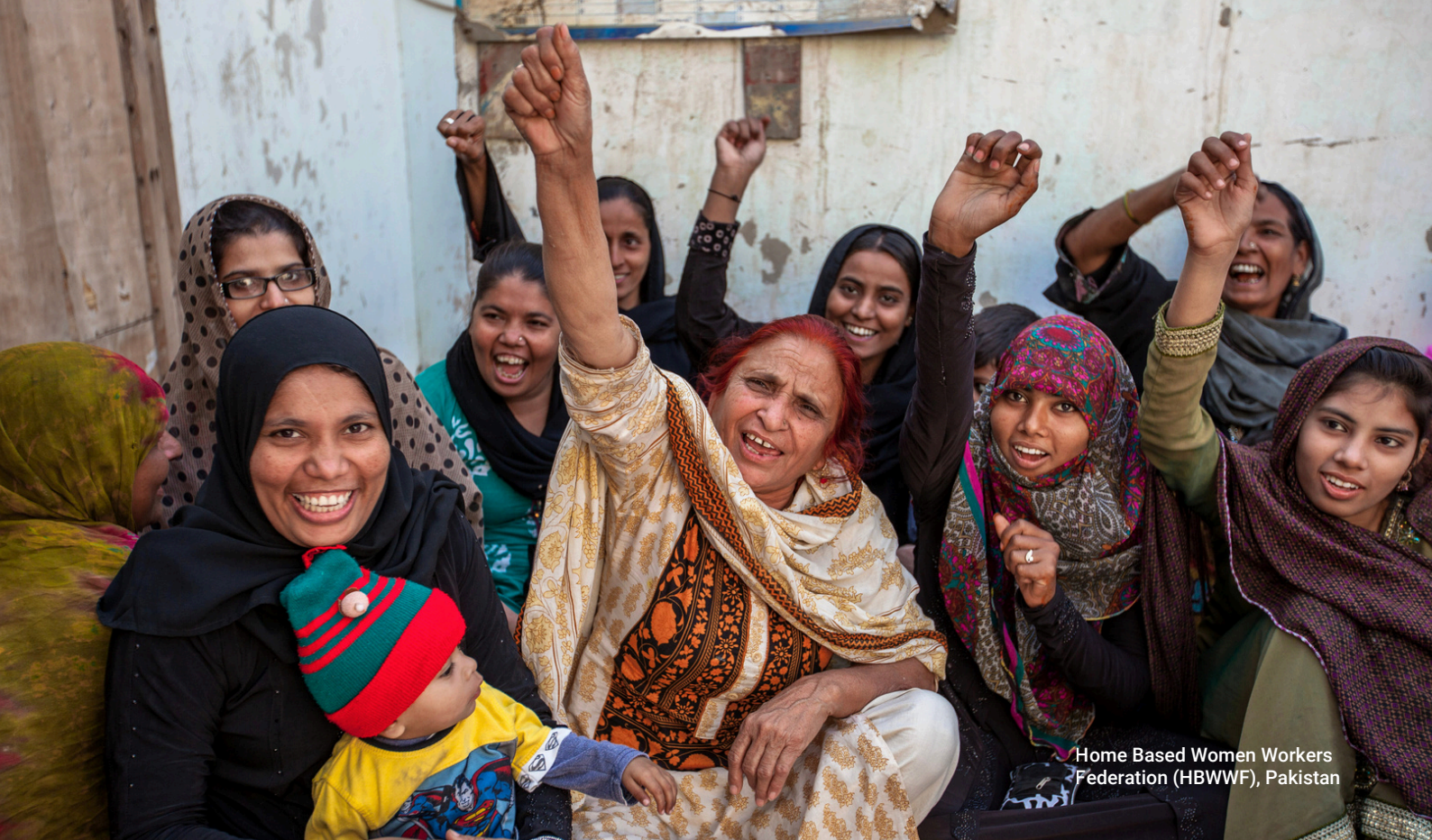
Home Based Women Workers Federation (HBWWF), Pakistan