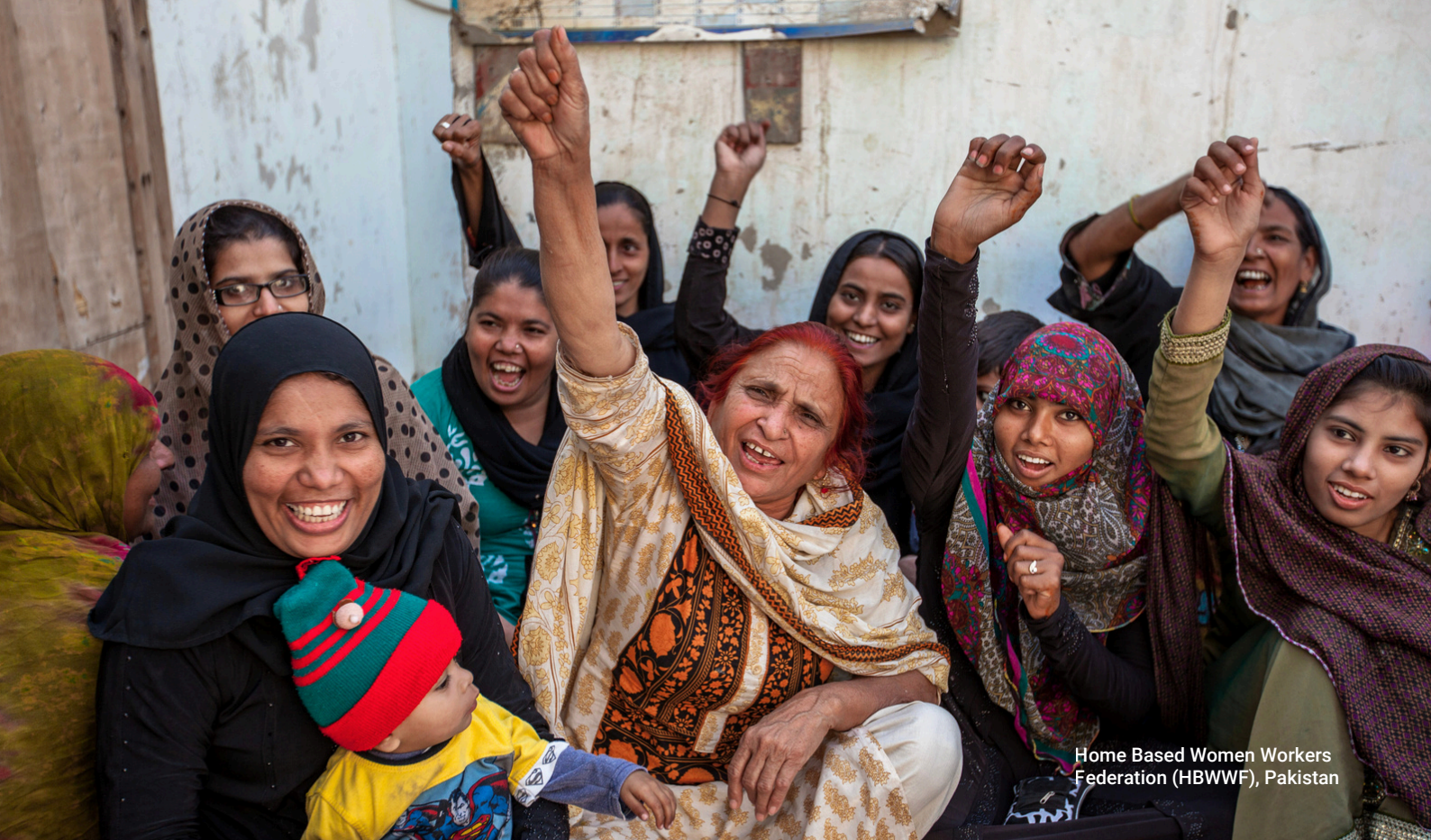
Home Based Women Workers Federation (HBWWF), Pakistan