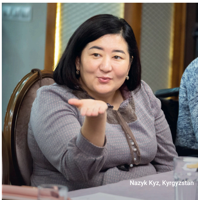
Nazyk Kyz, Kyrgyzstan

Rising authoritarianism and deepening inequality demand innovative ways of sharing resources — approaches that meet today’s realities head-on.