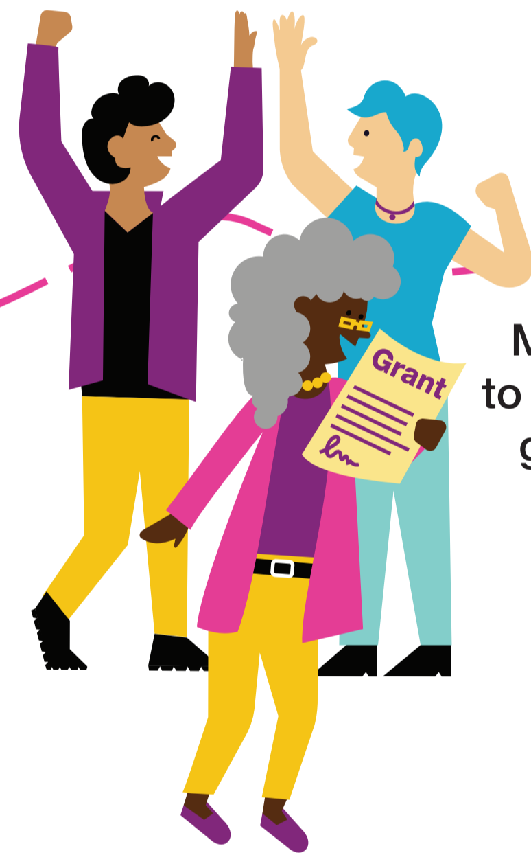
Mama Cash decides to make a grant to your group and transfers the grant.