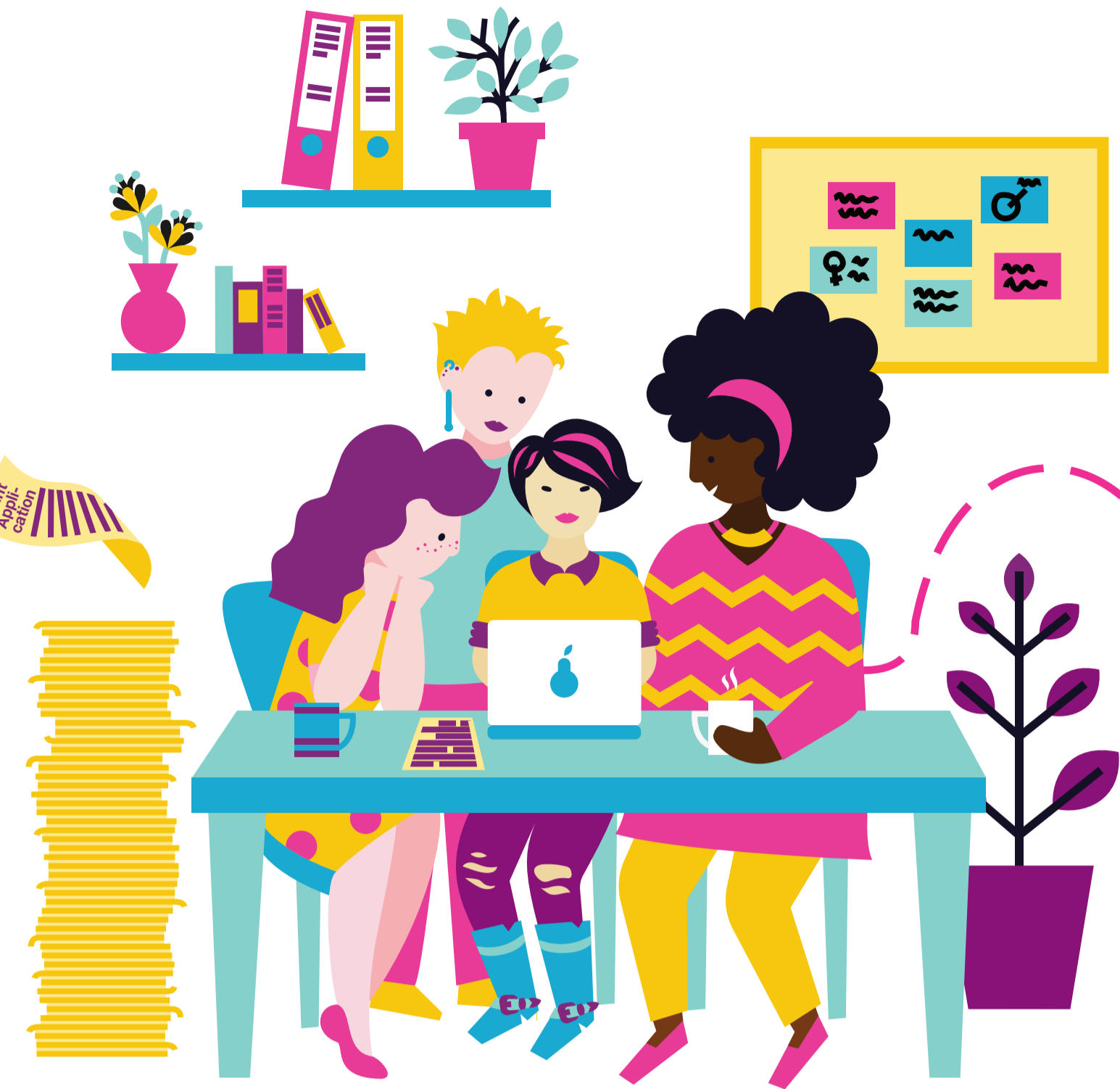
Mama Cash reviews your application and decides whether your application moves to the next step.