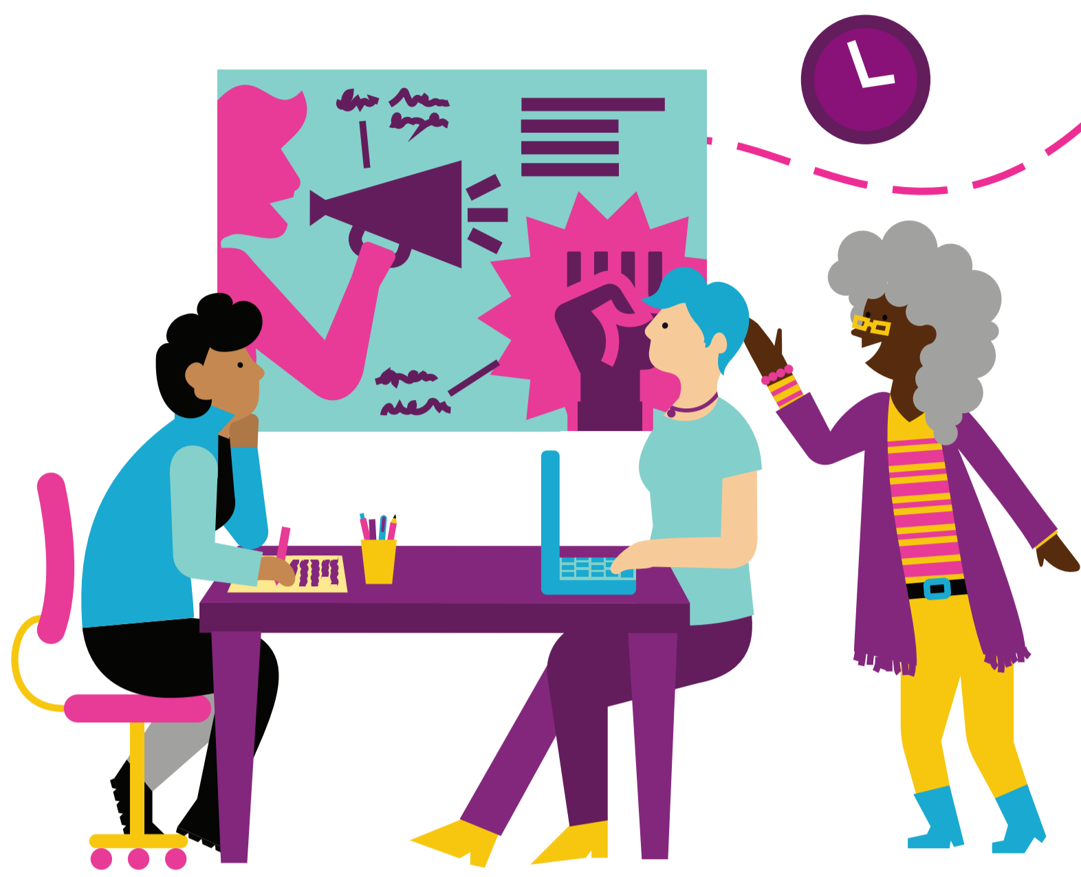
Your group submits your application for funding to Mama Cash.