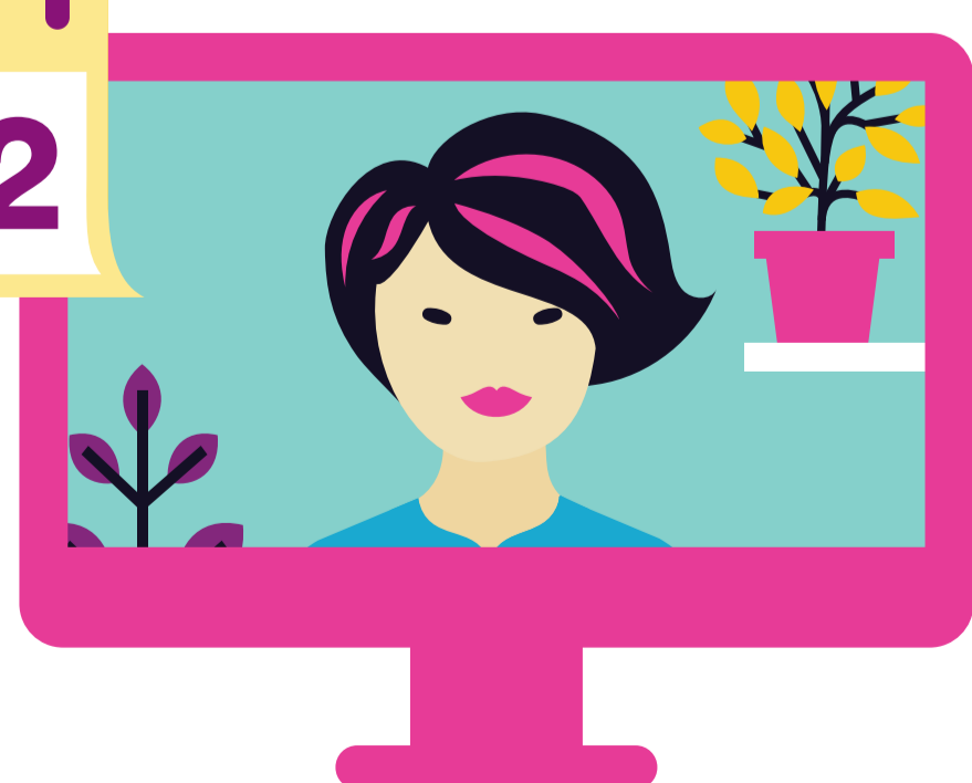
After 12 months we invite you to evaluate the past year including Mama Cash's support to you.