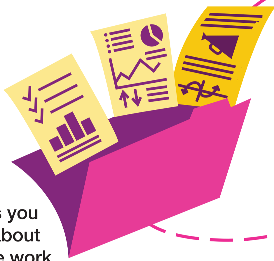
Mama Cash asks you more questions about your group and the work you do, and decides whether your application moves to the next step.