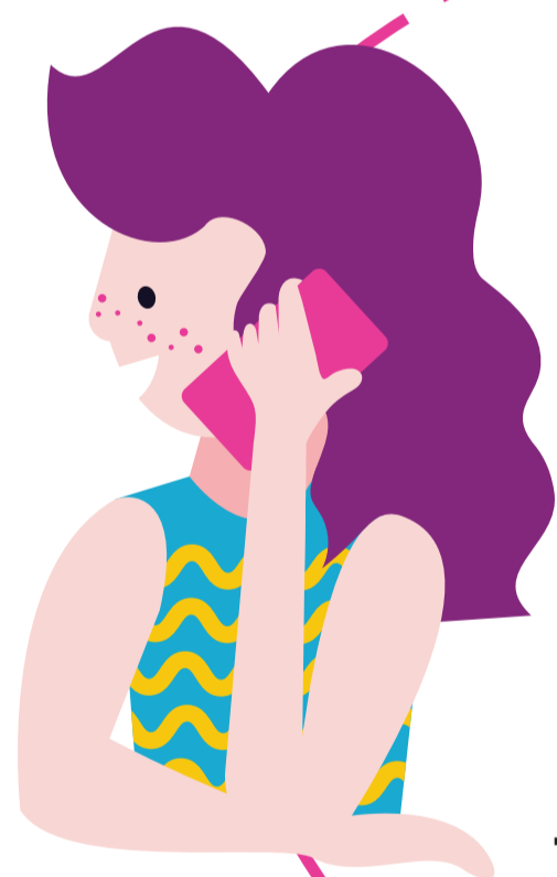
Throughout the grant period Mama Cash remains in touch with you to provide support.