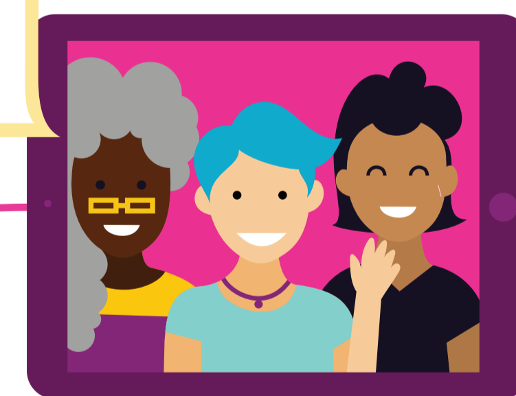
After 6 months we have a conversation together about how your group feels your work is going.